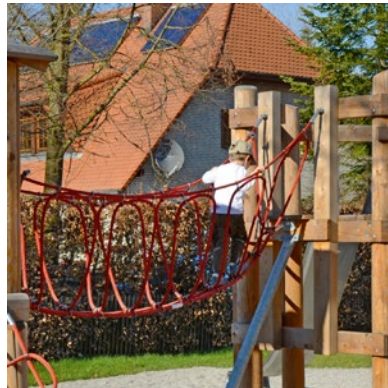
Rope Bridge on Platform