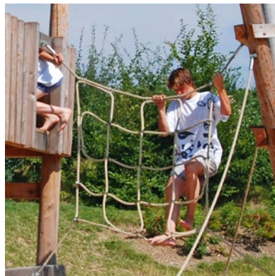
Climbing Net, vertical, on Platform