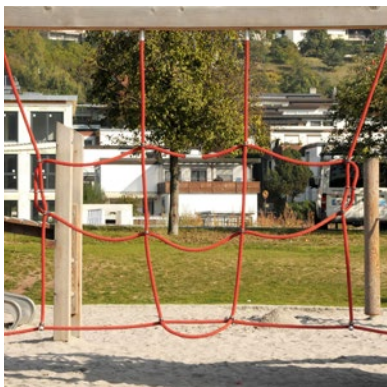
Climbing Net, vertical

No charge for publication of photographs in connection with this text when credited to: "Photos: Richter Spielgeräte GmbH, Frasdorf". We would appreciate a copy of the publication document.